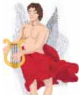
Jacob 14 colors, 31208 st. 100.7 x 171.5mm (3.96 x 6.75")