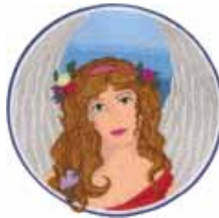
Audrey 20 colors, 43256 st. 125.4 x 125.4mm (4.94 x 4.94")