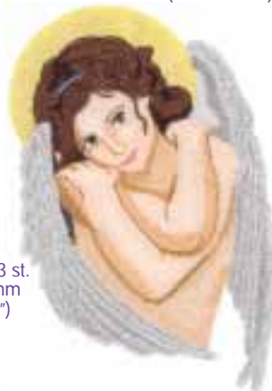
Love 17 colors, 43143 st. 116.4 x 175.9mm (4.58 x 6.93")