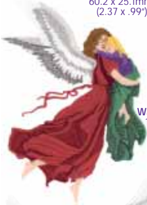
Watching over Celena 15 colors, 35462 st. 117.8 x 177.3mm (4.64 x 6.98")