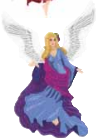
Sarah 17 colors, 35358 st. 122.5 x 177.3mm (4.82 x 6.98")