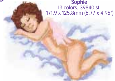
Sophie 13 colors, 39840 st. 171.9 x 125.8mm (6.77 x 4.95")