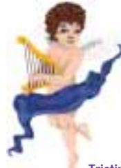
Tristin 14 colors, 10177 st. 69.5 x 100mm (2.74 x 3.94")