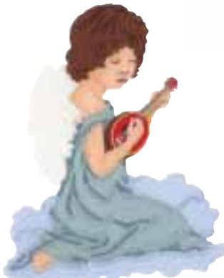
Mandy Lynn 18 colors, 31095 st. 124.9 x 158.1mm (4.92 x 6.22")