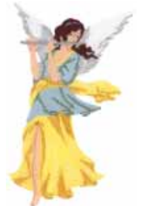
Summer 11 colors, 27349 st. 100.5 x 166.9mm (3.96 x 6.57")

Important: No refund or substitutions of opened materials. Damaged products may be exchanged for the same design pack. Cactus Punch, Inc. assumes no responsibility for shipping designs too large for your sewing field. CHECK DESIGN SIZES CAREFULLY BEFORE PURCHASING.